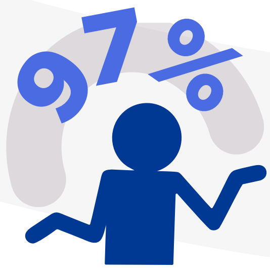
OF SLC employees agree that intercultural skills are valuable .

Internationalization of education aims to integrate international dimensions throughout the work of the College, including teaching, research and services.